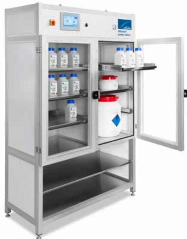
The ADDvance® powder cabinet provides the optimal storage environment for metal powders.

It is essential to maintain the correct atmosphere during storage in order to avoid humidity. Humidity will lower the flowability of the powder and will increase the amount of O 2 during printing. The latest addition to Linde's AM solutions now includes Linde's ADDvance® powder cabinet to ensure optimal conditions for powder storage.