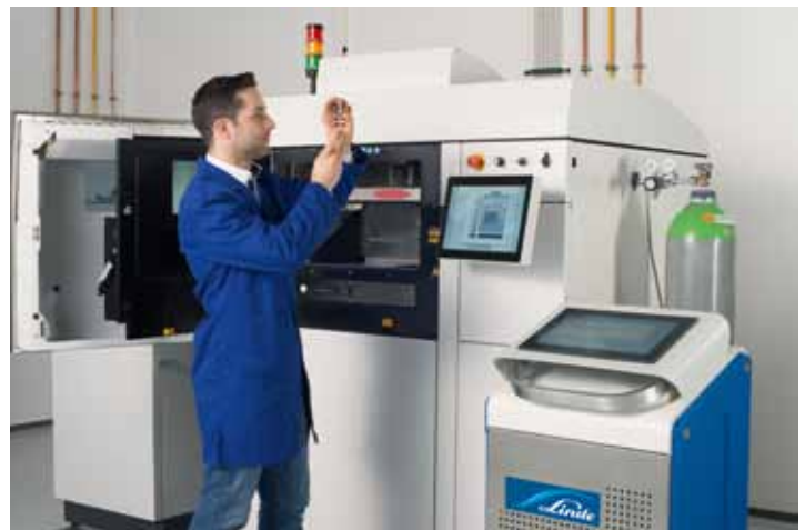
Reviewing the printed part.

Linde has developed a highly effective solution to improve cleaning. ADDvance® Cryoclean technology creates dry ice particles, or “snow”, by expanding liquid CO 2 and using compressed air to accelerate the particles up to sonic speed, shooting them onto the surface to be cleaned. The cleaning effect relies on flash cooling, kinetic energy, embrittlement and gas impact. If needed, a further abrasive agent can be added to the dry ice particles to remove more stubborn powder residue.