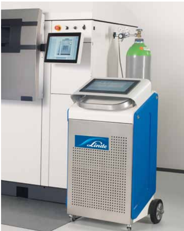
The ADDvance® O 2 precision ensures the atmosphere inside the print chamber.

Across all these AM approaches, atmospheric gases play a fundamental role in both the core printing process in addition to pre- and post-production processes such as metal powder production and storage. As is well understood and established earlier in this article, the core AM process takes place within a closed chamber filled with high-purity