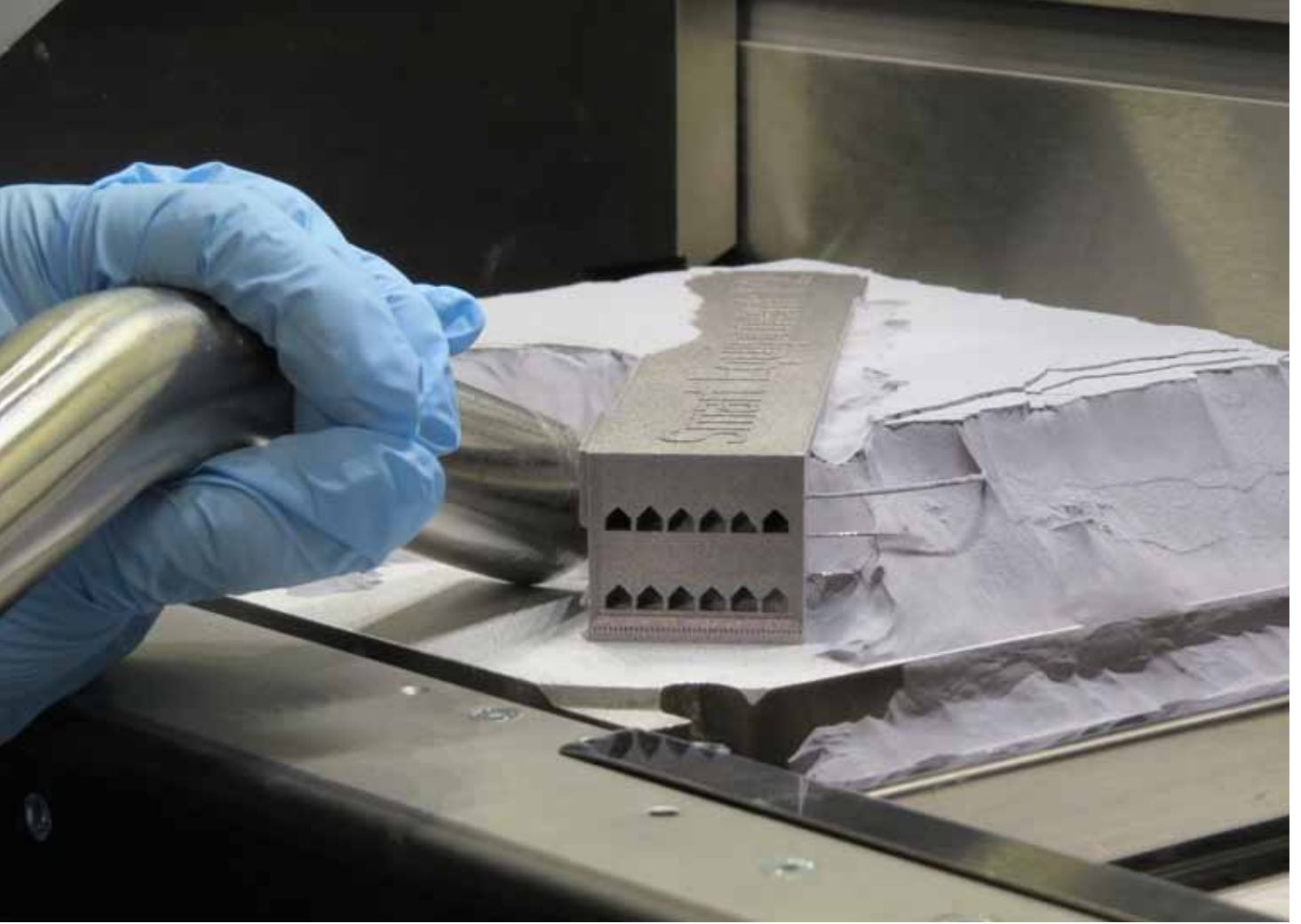
Post processing in action. With thanks to Trumpf.